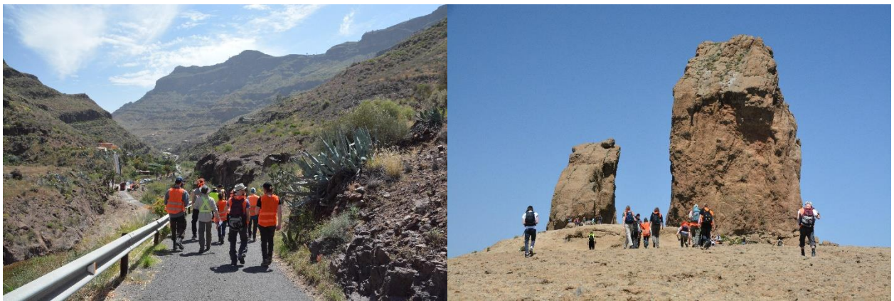
Field Trip to Gran Canaria SoSe 2023

(Examination Regulations 2019) Freiburg, Winter Semester 2023/2024